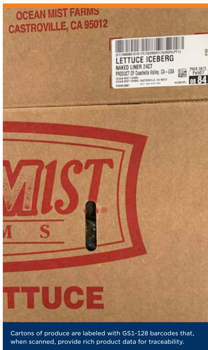
Cartons of produce are labeled with GS1-128 barcodes that, when scanned, provide rich product data for traceability.

The Ocean Mist Farms traceability system requires multiple verifications of the product data collected: at receiving, when placed into inventory, and when sent to a designated room and row in the warehouse. “Our launch was successful partly due to the fact that we all understood the importance of making certain our traceability information was accurate,” says Drew.